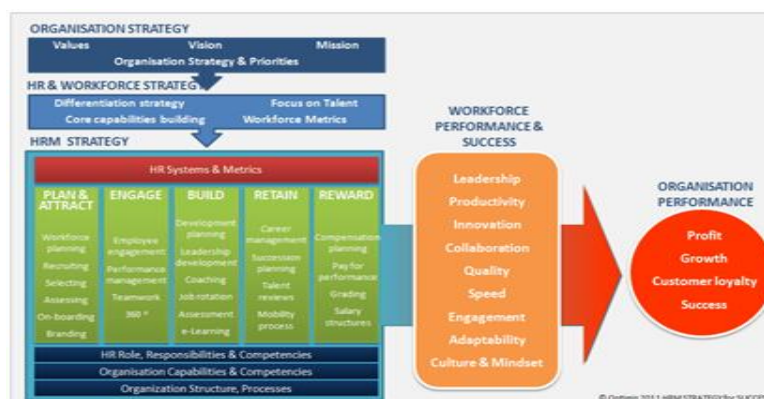
Figure 1: Model for Talent Management and Organizational Performance; Optimis (2011)

The talent management and organization performance model developed by Optimis (2011) defines several talent management elements and connects them to workforce performance, affecting organisational performance. Organizations struggle to compete without highly qualified personnel and ongoing human capital investments. For any firm to gain a competitive edge, having the right people in the right locations at the right times is essential[5].