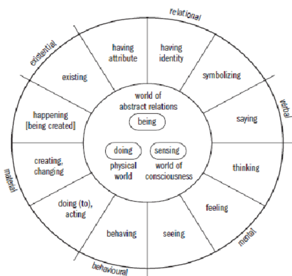
Figure 1: The Grammar of Experience-Types of Process in English (M.A.K. Halliday & Mathiessen, 2004, p.172)

Still, transitivity serves as a primary and effective tool for deciphering the meaning conveyed in clauses. This analysis involves studying the clausal structure, with the verb of the sentence serving as the foundation, known as a "process." The transitivity system categorizes processes into three main types: material processes (actions and events), mental processes (cognitive activities and perceptions), and relational processes (states and relationships). Additionally, it identifies three subsidiary processes: behavioral processes (actions involving behavior), verbal processes (communication-related actions), and existential processes (indicating existence or possession). This systematic breakdown allows for a nuanced examination of the different ways meaning is expressed through diverse processes within clauses as they are recapitulated in figure 1.