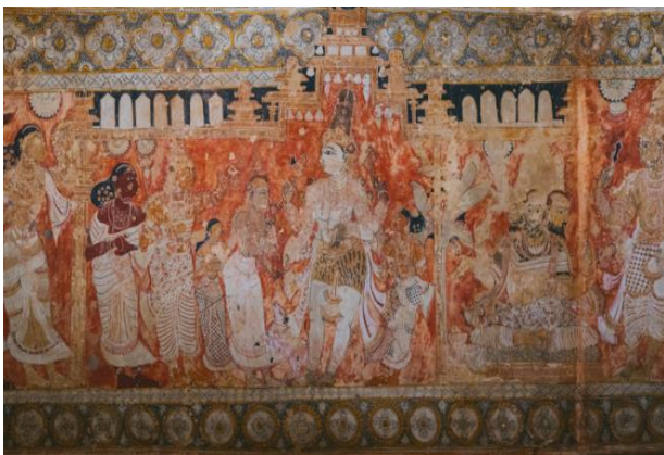
Virupaksh Pampa wedding