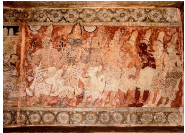
Asht dikpals attending wedding